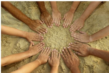
Be a part of Community 2000.