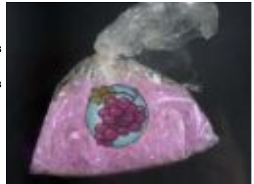
Candy flavored meth, myth or threat?

A spokeswoman for the State Bureau of Investigations said that the agency is investigating two or three cases of colored meth, but it doesn't know yet if the meth was flavored.