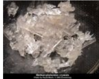
"Meth is typically a white or brown crystal..."

The sheriff's office conducted an undercover drug investigation from July to September in Ashe and in Grayson County, Va., and seized about 10 to 11 ounces of the meth, he said. Meth is often odorless or can sometime have a pungent chemical smell if it's wet, he said. This was different.